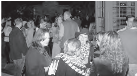
Supporters enjoying the event.