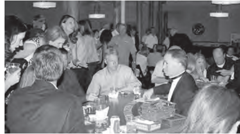
Supporters at casino table