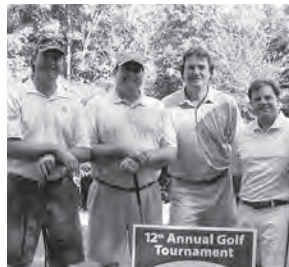
First Place Net: Champion Investment Corporation