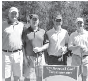
First Place Gross: Converse & Company

In September, Smith Drug Company sponsored our 12th Annual Golf Tournament at the elegant Musgrove Mill Golf Club in Clinton, South Carolina. Always a popular event, this year 16 teams raised $37,165.