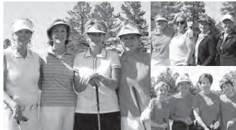
Gross Winning Teams

These ladies know how to have a swingin' good time! In May, Upstate Carolina Radiology and Southern Vascular Institute proudly sponsored our 7th Annual Ladies Swing Fling Golf Tournament at the beautiful Woodfin Ridge Golf Club in Inman, SC. This year 18 teams had a wonderful time and raised $13,854.