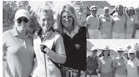
Net Winning Teams