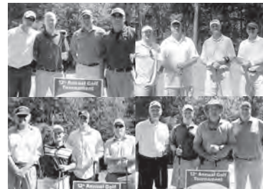
2nd Place Gross Spartanburg Radiation Oncology