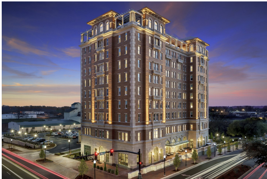
AC Hotel Spartanburg